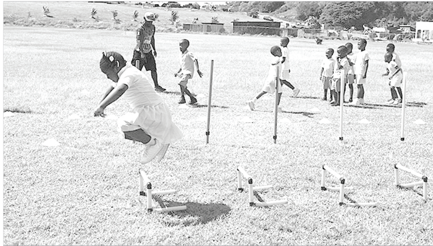
Students of the Sion Hill Government School making good use of the training equipment donated by Seakaid.